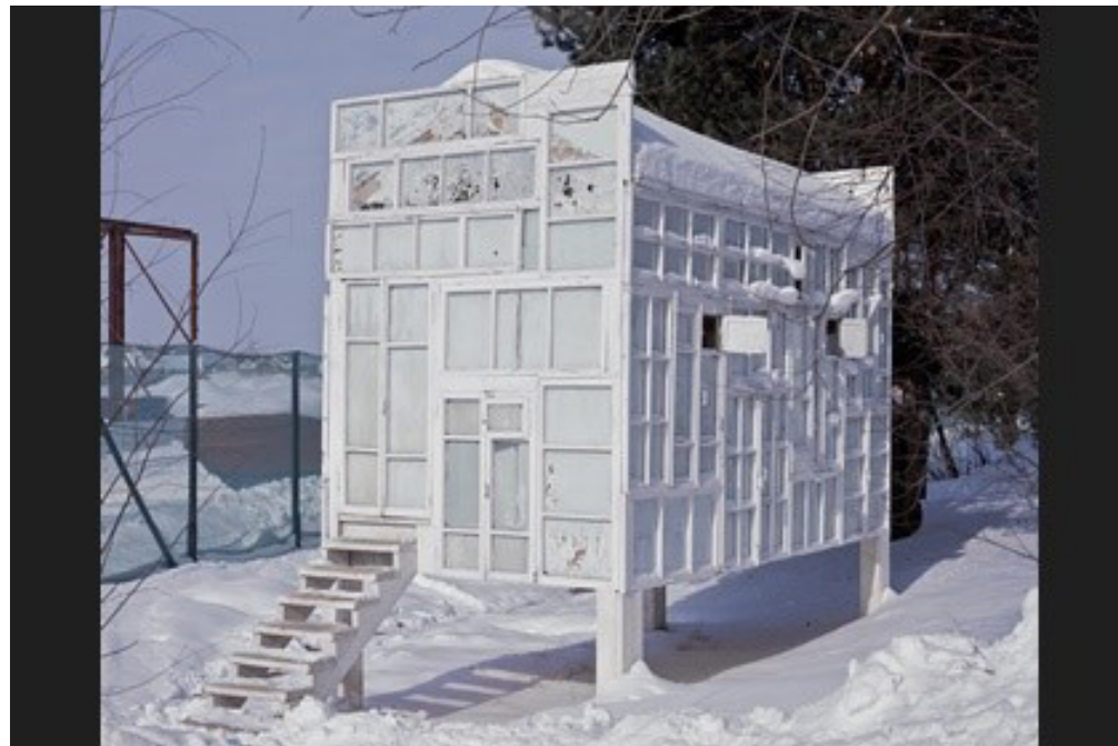
Fig. 10 - Pavilion for Vodka Ceremonies, Klyazminskoye Natural Reserve (RU), 2004