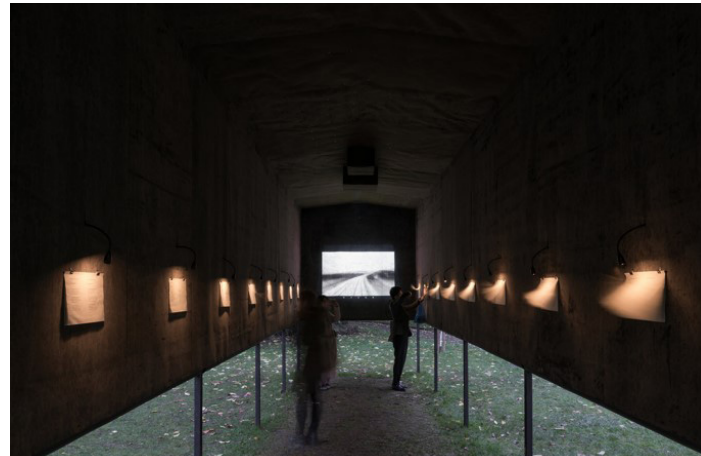
Fig. 16 - "101st km: Further and Everywhere" Pavilion, Bloomsbury Square, London (UK), 2017

al objects outside the site but from them the perception of both the natural landscape and the interior landscape, of each visitor, is accentuated.