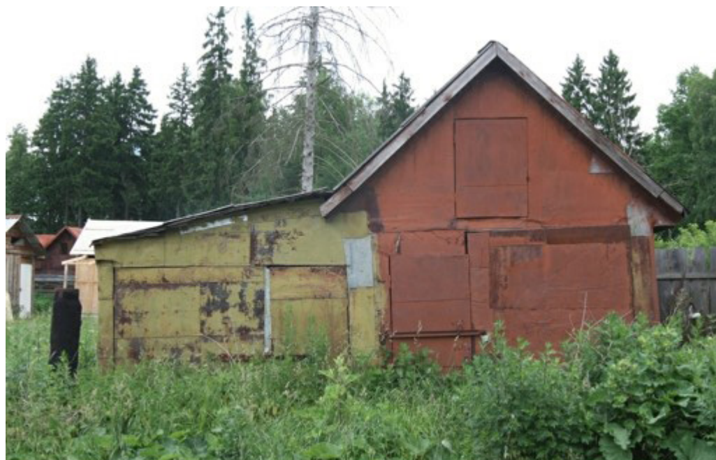
Fig. 17. Informal settlements near Moscow (RU), 1960