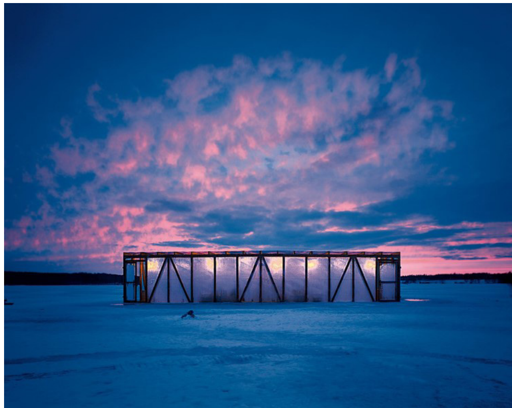
Fig. 8 - Ice Pavilion, Klyazminskoye Natrual Reserve (RU), 2002

In the same area, but with a short and winter use, he builds the Ice Pavilion. A body is constructed with parallelepiped geometry, structure of small wooden struts and metal mesh enclosures as a cage. Water was sprayed on it, which, with the low temperatures of the place and the station, built an authentic ice enclosure. A space where you can serve drinks to skaters that furrow the ice river (Moral - Andrés, 2015). A minimal pavilion, ephemeral and with a precise function. Alexander Brodsky transforms a natural environment into a facilities and user concentration place. With his proposal he is able to artificialize nature so that citizens can have a continuity in the services that they can usually enjoy in the city.