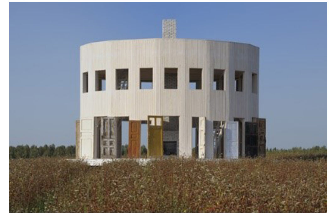
Fig. 12 - "Rotunda", Nikola - Lenivets Art Park (RU), 2009

He projects an oval geometry body with a lower perimeter open by a sequence of doors, practicable, coming from several demolitions located in the region. On the upper level it has an internal balcony where a series of windows with the same rhythm as the lower doors are also located. Visitors can also perch on the terrace of the building. The center of the space is occupied by a chimney and visitors can sit around it while they contemplate the landscape through this device with multiple patterned holes. Brodsky again confronts us with the memory of the loss, exemplified by the varied, imperfect