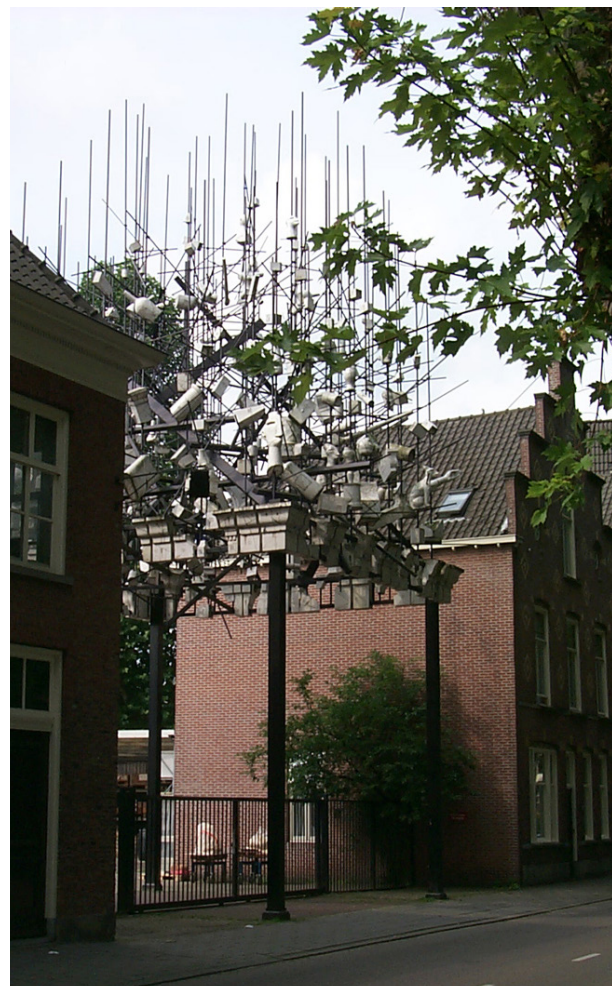
Fig. 3 - "Opening Project" pavilion, Den Bosch (NL), 1992

them, it manages to define a new area for the city and its inhabitants within a limited period of time. This way of building the territory in a limited time is based on simple, even poor, construction systems. Alexander Brodsky defines strategies that contrast sharply with much of the current urban dynamics.