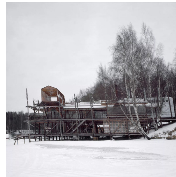
Fig. 7 - 95° Restaurant, Klyazminskoye Natural Reserve (RU), 2001

Between 2000 and 2001, he proposes the 95° Restaurant, on one of the banks of this place. The program to be solved also has a use of jetty and the whole set destined to give service during the summer season (Brodsky, 2009). It has three levels: wharf floor, forest floor (bar - kitchen) and gazebo floor (dining room). The general structure is solved with a network of beams and wooden pillars capable of supporting slabs where, in a scattered way, closed volumes appear inserted in terrace areas. The facade materials are poor as metal sheets and Plexiglas but their most relevant formal feature is the slight inclination of the supports, 5° above the vertical, to adapt to the traces of the surrounding trees according to a formal intuition of the author (Moral - Andrés, 2015). It is a body destined to be a point of services for the users of the place. A kind of imperfect place able to meet the simple needs of any person while infiltrating a first-order nature. An intervention outside the architectural rules found in the restoration establishments of the Reserve. Being temporary and with a prospect of gradual degradation, it resisted time more than planned (Dana et al. 2011). The project acquires a border formalization