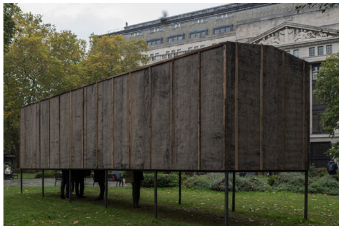
Fig. 15 - "101st km: Further and Everywhere" Pavilion, Bloomsbury Square, London (UK), 2017