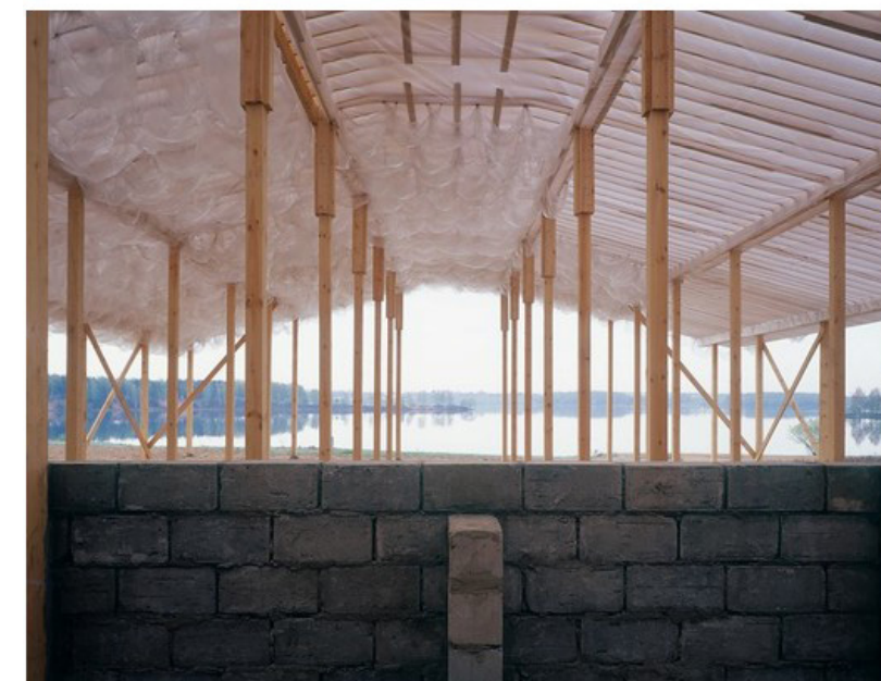
Fig. 9 - "Cloud Café", Klyazminskoye Natrual Reserve (RU), 2003

Three years after the first of these interventions, again in the same area, he raises a temporary construction under the name of "Cloud Café" next to the water where the land has a slight slope. The program is again a minimum catering equipment, a tiny coffee for use by vacationers who go to the Nature Reserve. Six rows of wooden supports define a gabled body that later was covered with plastics its cover. Plastics similar to those of shopping bags that sought to give it an appearance similar to that of a cloud that finished landing on the spot. The bar is defined with concrete blocks and the kitchen is camouflaged because its walls are covered with mirrors to reflect the context in which it seeks to ambush. Its life cycle exceeded the expected and reached several anniversaries on the same property and with the same utility. The intervention seeks to be mild, almost ethereal, accentuating its condition of accidental building. A proposal that materializes the particular reading of the place made by the architect.