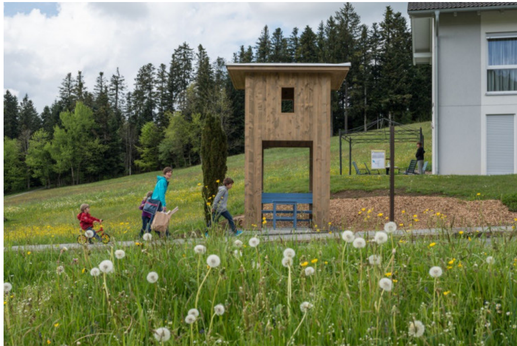
Fig. 5 - Bus stop, Krumbach (AT), 2014.

Alexander Brodsky has worked on different small-scale interventions that have marked his career since 2000. The Apsu Club of 2003 is proof of this. Here, verandas and painted glass were reused as basic elements of the intervention (Brodsky, 2009). This local reality has also been transferred abroad as we can locate in the small Bus Stop in the Austrian town of Krumbach in 2014 where on this occasion the design is protected by quality materiality and within an operation of significant impact media by the names of architects involved as is the case of Sou Fujimoto, one of the authors of the summer pavilions of the Serpentine Gallery and Wang Shu - Amateur Studio, Prtizker Prize for Architecture, to name a few of them.