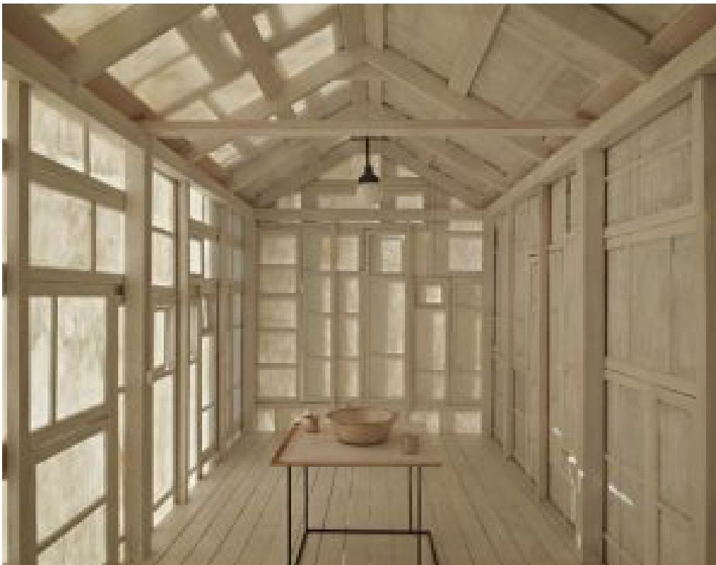
Fig. 11 - Pavilion for Vodka Ceremonies, Klyazminskoye Natural Reserve (RU), 2004

nstruction is raised on the ground a little more than 1 m high, resting on four wooden pillars and with a very small volume of gabled shed. All of its envelope, except the ground, is built using recycled woodwork, rescued from garbage in different parts of