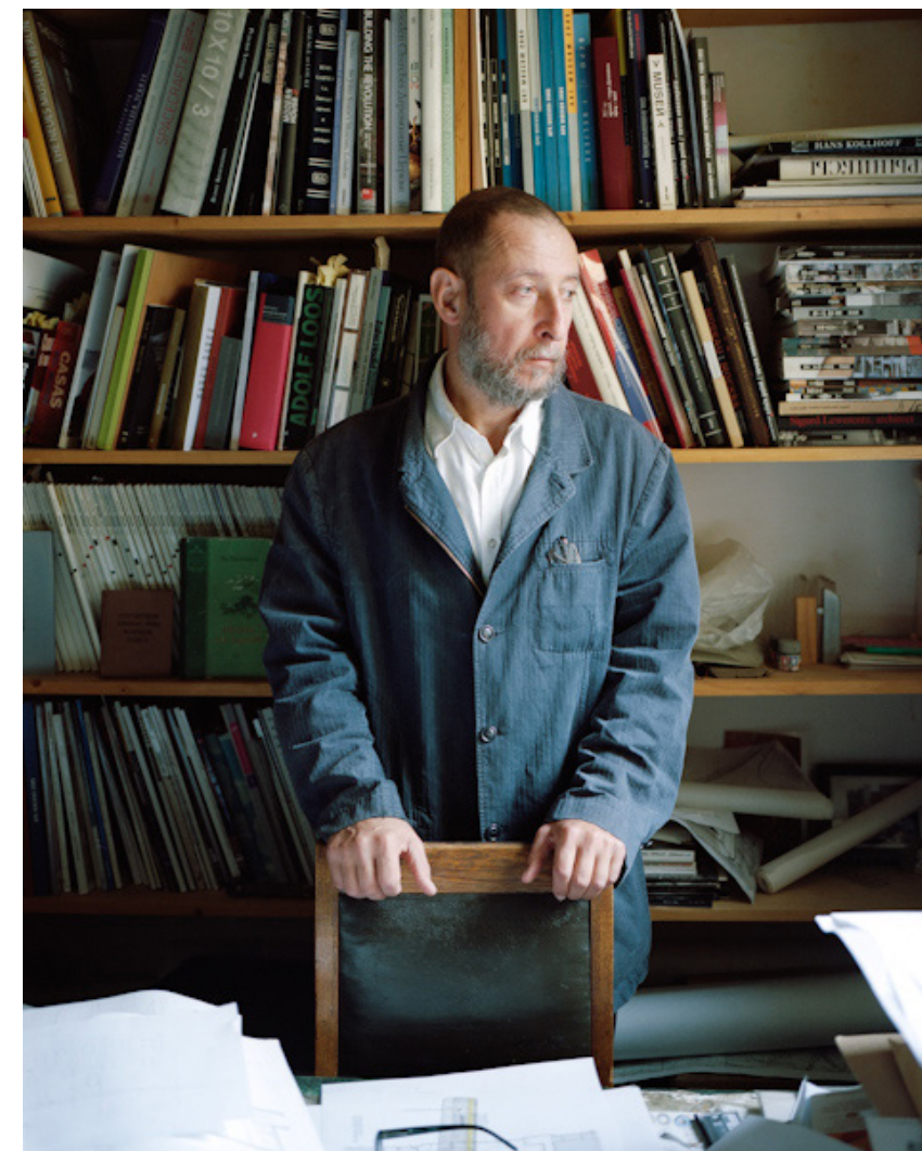
Fig. 1. Alexander Brodsky in his Moscow office

how especially singular works can arise, from small scale but of great transformative capacity. The works developed from the office of the Russian architect can reach the range of specific infrastructures but also a more transcendent level such as memorials. In all of