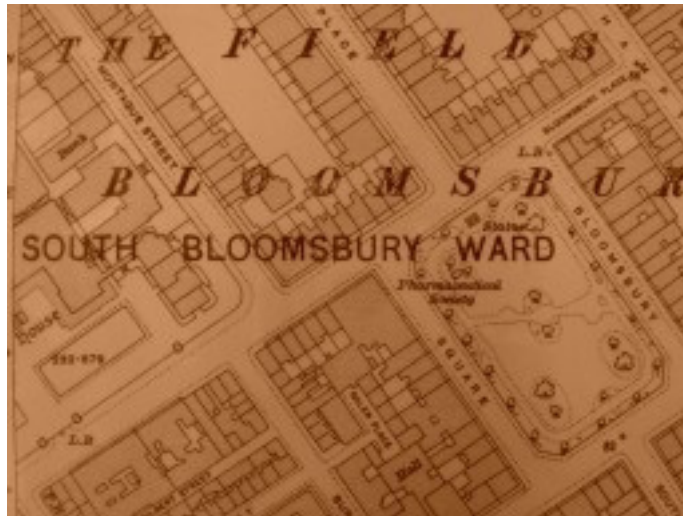
Fig. 13 - Bloomsbury Square, London (UK), S. XIX

doors, which contrast with a wooden enclosure, painted homogeneously in white. A materialization that confronts us with the visualization of the loss of what was built and that was systematically eliminated after an eager improvement. It also puts us in a new way of approaching the territory, the average device between the place and the viewer. The intervention qualifies a fragment of landscape while promoting a new point of stay and meeting around a fire. This intervention recovers some of the parameters already contemplated in the Pavilion for Vodka Ceremonies with the variant of the aesthetic qualification of the territory: it is an icon with transformative traces from a social and territorial reading. In both cases the presence of the intervention is relevant in the place. None of them seeks to camouflage themselves in that context. They are two architectur-