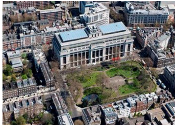
Fig. 14 - Bloomsbury Square, London (UK), S. XXI