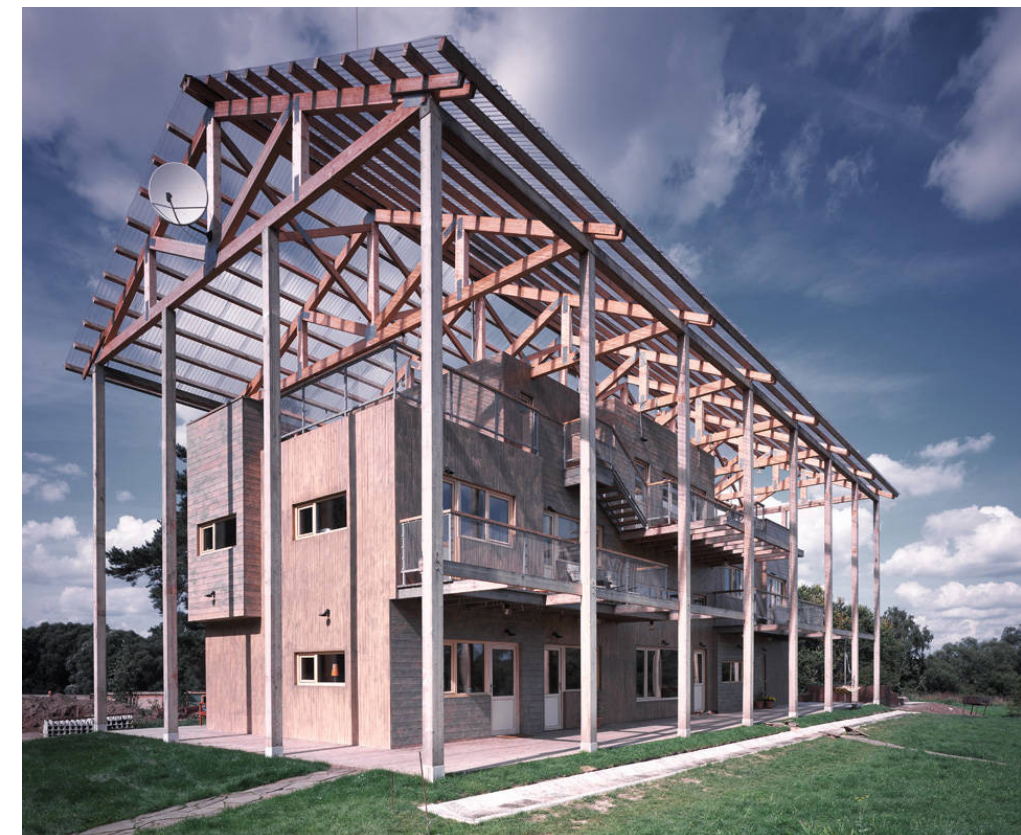
Fig. 4 - Tarusa House, Kaluga (RU), 2006

We can make a brief reading of both: Green Cape presents an elevated platform, a plant above ground level, which characterizes the house. On it there is a kind of independent pavilions, two similar to some small cabin frames and a third, stony, with traces of mastaba. Under the indicated platform a glazed body seems interrupted by the start of the aforementioned heavy factory body. At the extreme of the house we find the most open spaces and it is in its central area where a functional distribution with a motley character appears. Tarusa House is characterized by presenting a main volumetry, again in the shape of a cabin with gable roofs and with a perimeter, without accessories and small pillars distributed homogeneously on all four sides of the perimeter. Within this maximum volume there is a wooden body of straight geometry and flat roof and arranged asymmetrically with respect to the central axis of the roof. The area of maximum use of sunny hours has balconies and terraces on the first and second floor. This body, characterized by the massive use of wood, has different setbacks that also affect its interior spatial configuration.