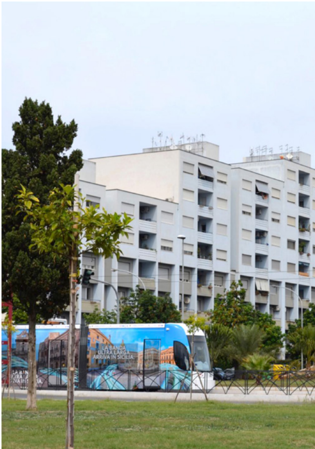
Fig. 9 – Tram line and public housing in the southern neighborhoods

Beyond these issues, however, these projects had the effect to reanimate the debate on the city's modernisation process. When in 2012 local government returned to the centre-left coalition, the new mayor declared that mobility would have taken a central place in his government activity. Along with the completion of the urban rail network, the greatest efforts of the municipality were addressed to the promotion of sustainable mobility systems. In this direction, after two years of negotiations with the local residents and retailers a large free-car zone was created in the old town, as well as several pedestrian areas around the main historic landmarks.