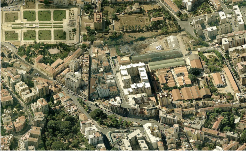
Fig. 5 – The Zisa area with the Cantieri Culturali district