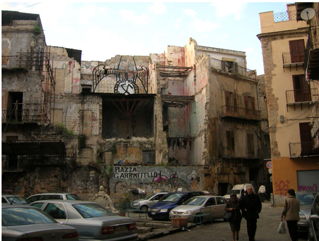
Fig. 1 – Urban decay within the old town in the nineties

Not surprisingly, when the municipality decided to participate to the Urban I Initiative the selected area for the programme implementation was its historic centre, a dramatic symbol of urban decay and, at the same time, a place plenty of opportunity for the relaunch of the city. More precisely, the targeted area was an half of the old town bordering the waterfront, extended 112 hectares with a population of around 11,000 inhabitants. As a result of bombing in the second world war and continuous collapses in the built environment, the area had been abandoned from thousands of old residents and the main commercial activities (Lo Piccolo, 1996). Within the remaining community, widespread issues such as social marginalisation and unemployment (around 35%)