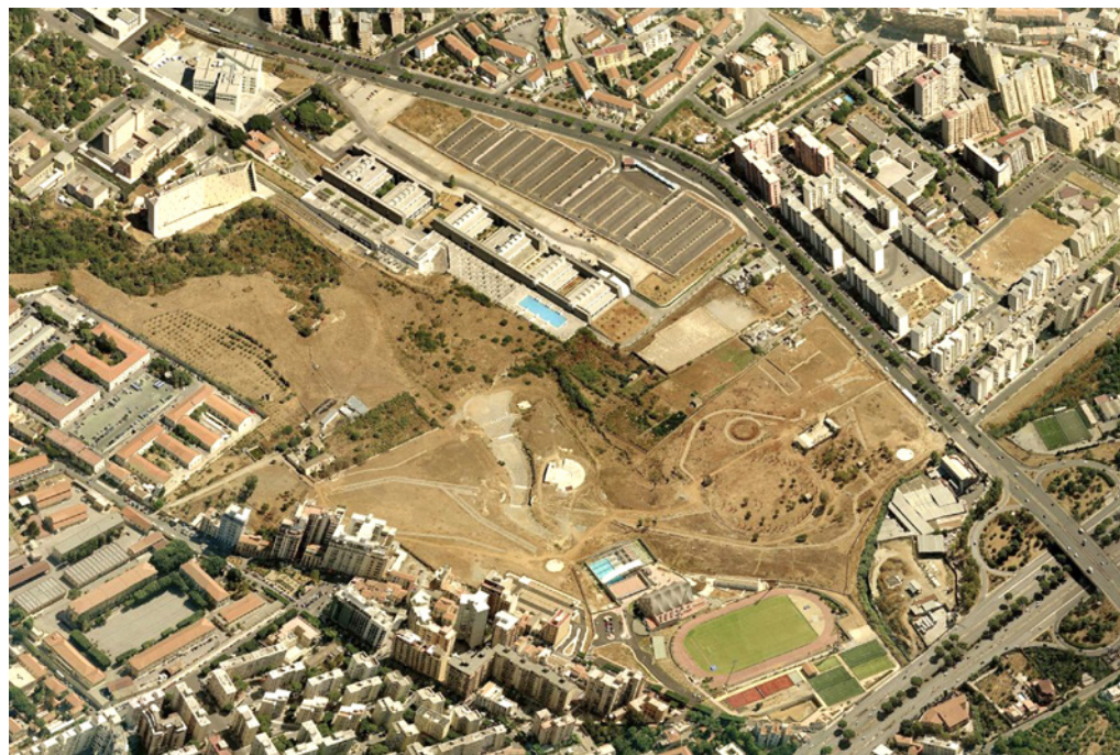
Fig. 4 – Green area and sport facilities in the university campus

The objective of strengthening the city's identity was based on the creation of new cultural facilities, with a flagship intervention – a new museum of Euro-Mediterranean contemporary art – within the Cantieri Culturali alla Zisa, an ancient industrial site partially reconverted into a cultural district at the end of the nineties. The interventions on the old town included also a programme of incentives for the retailers of the traditional markets, as well as restoration works in different parts of the historic area.