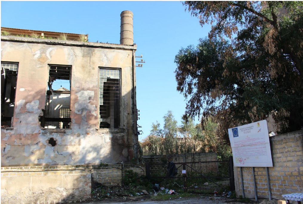
Fig. 7 – Abandoned works in the Chimica Arenella site

project expectations were revised several times over the years (Vinci, 2009). Some of the largest projects were abandoned, first of all the two business parks, while many others – as the museum of contemporary art – were downsized and only partially carried out. Problems of implementation affected also the section of the programme dedicated to tourism, on the one side for an overestimation of the potential beneficiaries and, on the other, for the lack of coordination between the public and private sector.