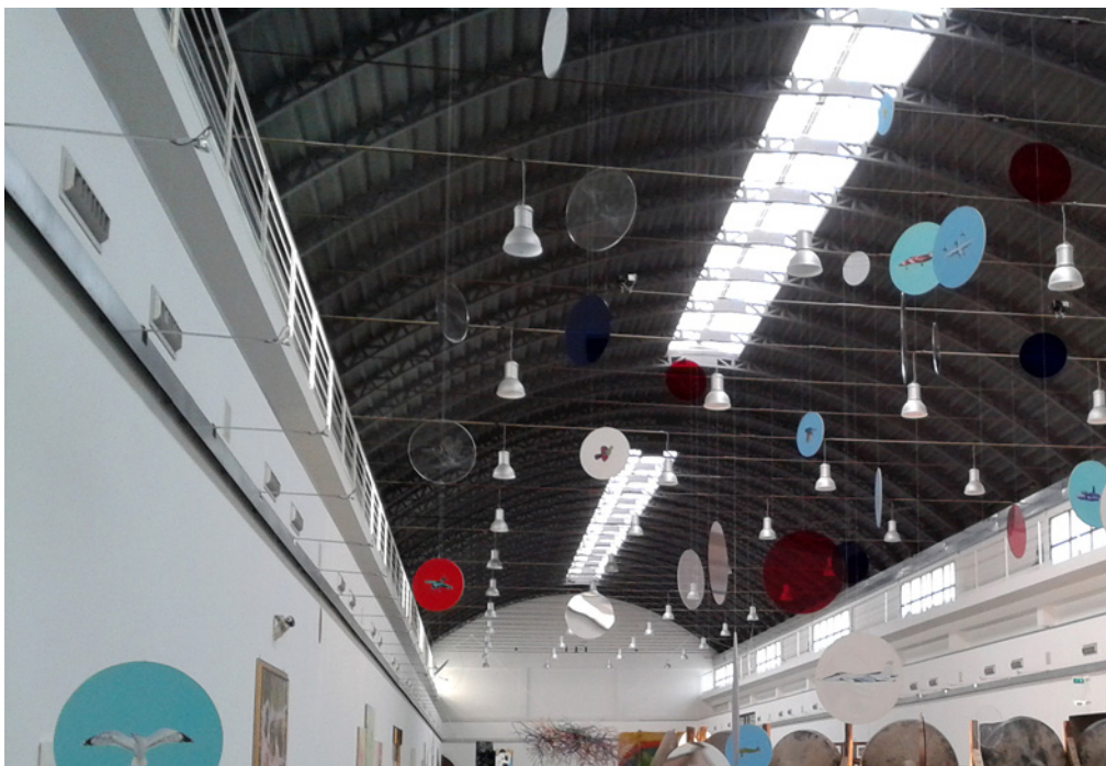
Fig. 6 – Museum of contemporary art at the Cantieri Culturali

The second objective was based on the creation of two business park (incubators and exhibition area) within the Chimica Arenella and the Manifattura Tabacchi, two sites of industrial archeology at the margins of the city centre. This part of the project was also supported by several training programmes and aids to enterprises, with the aim of creating a favourable context for the emergence of new companies especially in the ICT sector.