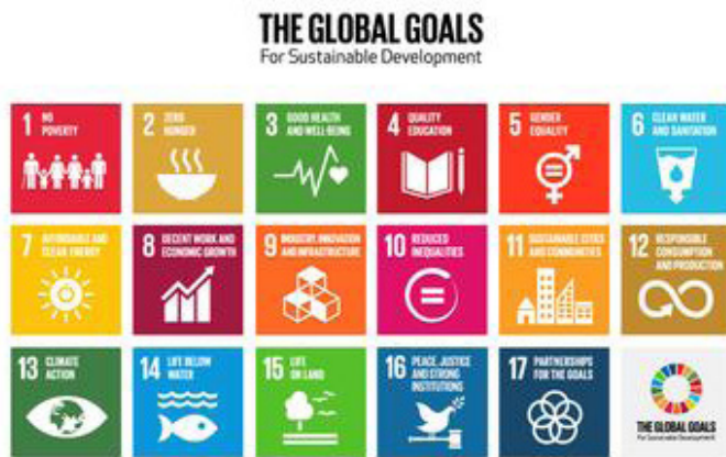
Fig. 1 - The 17 SDGs of the 2030 Agenda for Sustainable Development 2015

17 Sustainable Development Goals (SDGs) and 169 targets, for addressing the social, economic and environmental dimensions of development and their interrelations (fig.1). The National Governments committed to engage in the systematic follow-up and review of the implementation of the 2030 Agenda that will be based on regular, voluntary and inclusive country-led progress reviews at the national level. Monitoring of MSDs is complex and the integration with the New Urban Agenda could represent an opportunity to improve clearly the selected procedures .