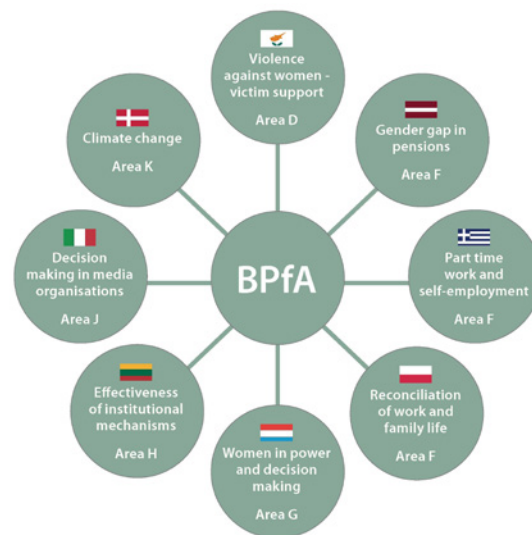
Fig. 5 - The BPfA Beijing Platform for Action

The significant element of Gender Equality Index regards the gender gaps between women and men, evaluating gender equality in a extensive approach. It considers gaps responsible for the existent disadvantages of either women or men as equally problematic. The Gender Equality Index assesses gender equality taking into account both gender gaps and produces complex information according to different levels of