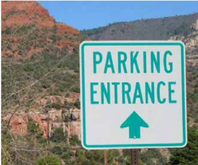
The location of parking facilities is a major issue of transportation planning.

phenomenon makes the increase of parking capacity desirable only for a limited amount until reaching an optimal level. After this limit, it makes the environmental quality of transportation gradually worsen, with higher demand for additional road capacity and even more parking capacity, which not always may be satisfied due to land availability constraints. Moreover, additional concerns are related to the adoption of land use patterns associated with huge parking facilities. They contribute to shape the new developments, in particular in suburban areas, with the formation of a more car-dependent mobility and a reduction in the accessibility by walk/public transportation. The process determines the formation of large energy intensive (and energy wasting) systems, with associated lower quality of life and environmental decay.