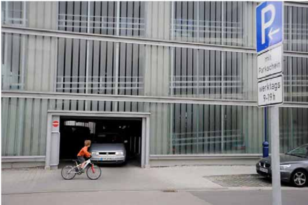
Structured parking overcomes the scarcity of developable land in central areas.

the necessity of quickly making transportation system more sustainable, and of reducing the externalities of transportation. The environmental impact of transportation is mainly associated with the use (and often misuse ) of cars and private vehicles. As already mentioned, the design of parking facilities greatly affects the use of cars in urban and suburban areas. Hence, the approach used in their development may actively contribute to rebalance the use of transportation in more congested areas, if part of an overall strategy for sustainable mobility.