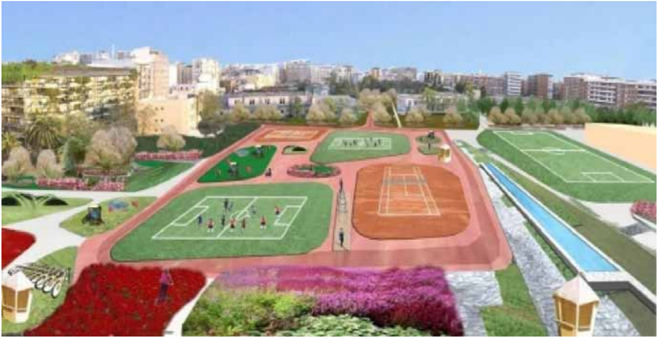
Redevelopment project of the ex-military area “Rossani” in the city of Bari.

planning, with a dramatic lack of long term objectives for the future development of the city. This was evident in transportation planning during the years 2004-2009: the case of the ex-Army base was only an example of an area available for green areas and city parks (or, at least, for the construction of an important bus terminal) that was quickly converted into a surface parking area. The same lack of coherent choices was found in the definition of mass transit priorities, and in particular for one of the park and ride lines. The parking lot at the end of this line is located in the immediate proximity of a city park (on a portion of land that should have been designated to an expansion of the city park), in the semi-central neighborhood of Carrassi. This constitutes a non-sense from the point of view of the efficiency of the system, since it attracts additional private vehicles in a semi-central area, and originates more congestion in this neighborhood.