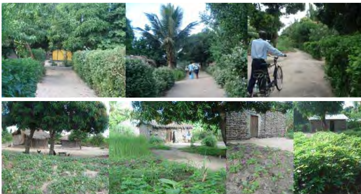
Fig. 5: Thermal comfort, environmental upgrading and food security. Top from left to right: Trees and greenery provide a healthy urban environment and minimize lacking infrastructure; Streets are safe and pleasant places for playing, strolling, rest and chat; Primary school teacher cycles back home. Bottom: fruit and shade trees, food growing and poultry at the ODS.