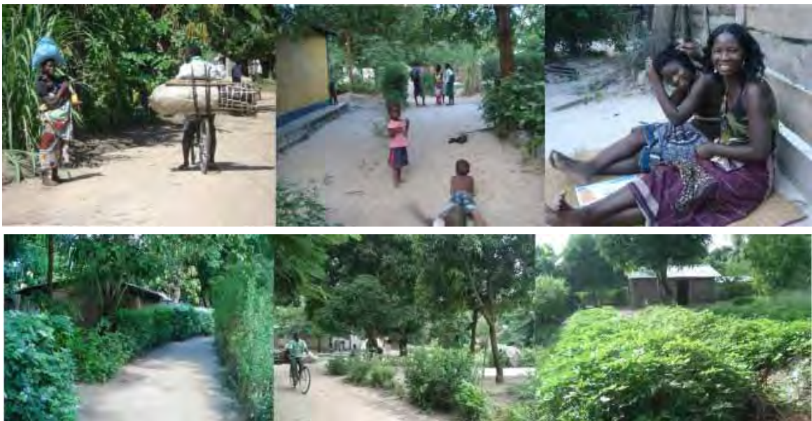
Fig. 7: Urban inclusion, security and community urban management. Top from left to right: Chatting on the way to work in the neighbourhoods; Children play freely in the neighbourhood's streets along with neighbours chatting; Teaching her daughter a new hair style under a mango tree shade while drinking lemonade at their ODS. Bottom: Streets are collectively maintained clean.