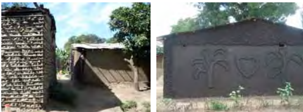
Fig. 4: Bare and plastered maticado houses (left); and decorated wall in earthen plaster 'matope' with corrugated zinc roof (right)

process of self transformation and rediscovery. This is the result of a set of changing factors, including: (a) growing modernised tastes, due to many foreign influences through history, urban migration, media and proximity to modern house models; (b) a general desire for 'Western-style progress' directly associated with the stigma traditionally equated with backwardness; (c) increased purchasing power to build costly modern houses and buy large modern items of furniture; (d) less time (and will) to collect natural materials and carry out traditional house maintenance due to changing lifestyles; (e) the scarcity of natural building materials in the city and their rising prices on the urban markets, together with the abundance of recycled or gradually more affordable industrial building materials; and (f) the fact that houses with right angles are easily built and are more adaptable to different building materials and technologies, (and to modern furniture) leading to the gradual replacement of the traditional circular maticado Mozambican house with a quadrangular or rectangular design (Bruschi et al. 2005, Raposo 1988, Verissimo 2010). However, this 'modernisation' is more obvious in Maputo than in the rest of the national cityscape, which is composed of medium and small cities where, according to fieldwork and statistical data, the prevailing built environment and skyline in the neighbourhoods apparently remains traditionally built and green (see Figure 4) (INE, 2007).