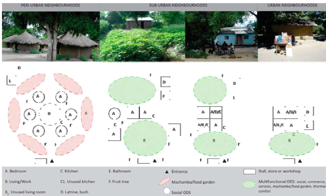
Fig. 1: Outdoor Domestic Space transformation and livelihoods self-organisation in the spontaneous neighbourhoods of Dondo Municipality

dualistic city, which I call the Agrocitcity, the Outdoor Domestic Space is resilient because it is able to adjust domestic space as a strategy to secure livelihoods, provide urban food, commerce and services, maintain vital kinship relationships and produce a comfortable and clean microclimate across the spontaneous neighbourhoods (see Figure 1). This spatial resilience is the feature underlying the self-organisation of neighbourhoods with a new way of overcoming alienation from nature, which suggest the continuance of an innate relationship between society, the human habitat and nature.