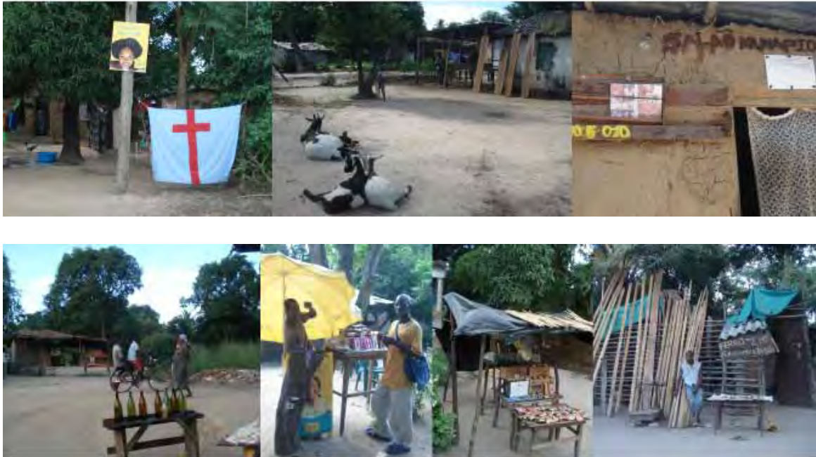
Fig. 6: Self-organising resilient and autonomous livelihoods. Top from left to right: This household sells sodas, cell phone credit and SIM cards, the husband is a prophet and traditional healer at their ODS; A carpenter works from his ODS where he raises goats, chickens and also cultivates cassava and fruit trees; A movie and TV 'saloon' charging entrance at ODS. Bottom from left to right: A carpenter displays his work at his door front while across the street someone sells cooking oil; door front stalls (cell phone credit and snacks) under a shade are a great place for gathering; Domestic grocery stall at ODS facing street; Selling building materials and used steel pieces for melting at door front facing busy street.