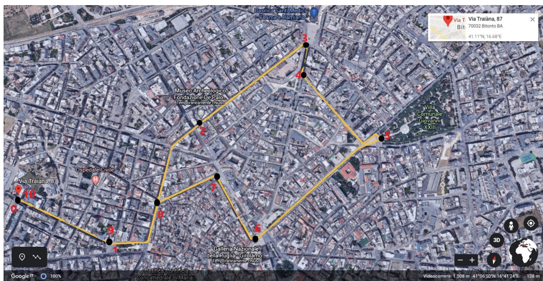
Fig. 1 Example of kmz file: track, photo snapshot and photo locations

This preliminary study takes into consideration the questionnaires completed by just one of these agents moving inside a large centre of the Bari hinterland, Bitonto, a city with over 60.00 inhabitants characterized by specialized olive and olive oil production. The path chosen by the agent is shown in the following image: