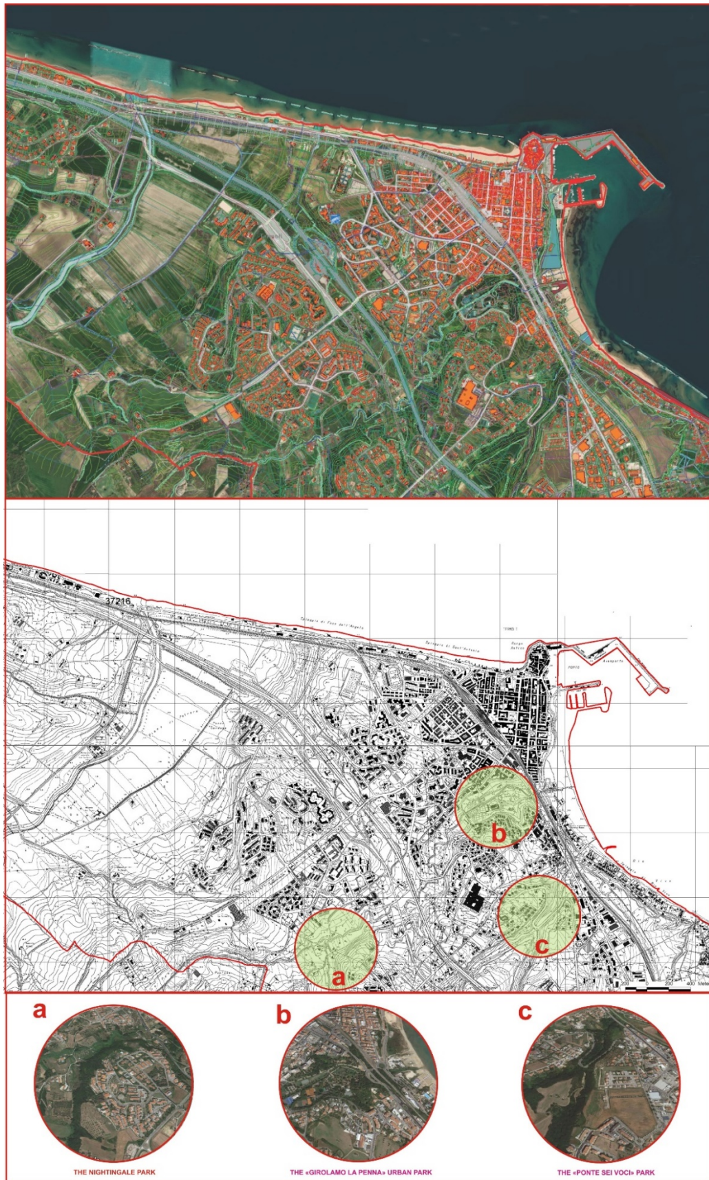
Fig. 2 The green areas system of the Termoli Municipality, located in the Satellite image and in the Regional Technical Map: a the proposed area named the "Nightingale Park; b the existing "Girolamo La Penna" Urban Park; c the proposed area named "Ponte Sei Voci" Park