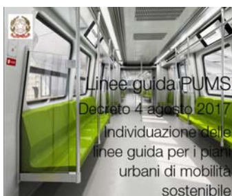
Guidelines for drawing up PUMS

To support the achievement of the objectives of the National Strategic Framework, in its various forms, Legislative Decree 257/2016, regulates the implementation of Directive 2014/94 / EU on the construction of an infrastructure for alternative fuels, moreover, the article 3 paragraph 7 letter c , explicit not only the adoption of measures aimed at creating the infrastructure for alternative fuels in public transport services, but also the adoption of guidelines for the preparation of urban plans for sustainable mobility (PUMS) to be implemented by decree of the Ministry of Infrastructure and Transport, subject to the opinion of the Unified Conference.