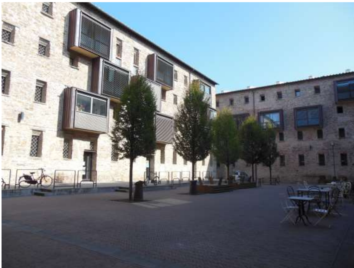
Fig. 2 Piazza delle Murate, core of the Urban Park of Innovation “Le Murate”

One such project was the framework MyFirenze , promoted by the City of Florence and activated since 2014 in the Multimedia Centre for City Visitors to Santa Maria Novella train station. It is realized in collaboration with the Media Integration and Communication Centre (University of Florence) and its aim is to enable tourists to plan their trips and optimise their time to visit the city. At first, the tourist finds the information at the tourism information centre and he/she defines the trip itinerary using natural interaction systems (tabletop and wall); then the personal plan is visualized on his smart phone, enabling access to advanced services and for updating the itinerary.