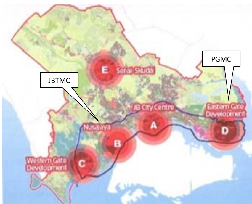
Fig.3 Flagship zones within Iskandar Malaysia

The selections of these areas are based on three dimensions, which are, neighborhood type, land use and economic activities. Neighborhood type was differentiated as Johor Bahru Tengah Municipal Council area built more recent, while Pasir Gudang Municipal Council area mostly cover residential area built in the early 90's. While for land use and economic activities, PGMC mostly involve in industrial and services activities, which provide more job opportunities and for JBTCM are very much related to government offices and commercial. Nonetheless, spatially or socially 'extreme' areas were not purposely targeted.