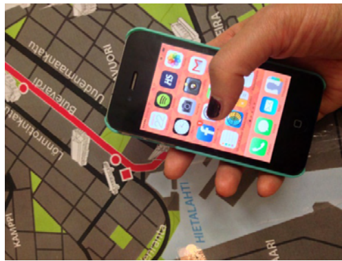
Fig. 2 Smart urban space devices

partners both from the public and private sector include: VTT Research Centre of Finland, the University of Bordeaux, the University of Caen, AICIA and ESI Tecnalia. The participating companies were While on the Move, Fara, Top Tunniste, Bonwal, Thales, NXP Semiconductors, Gemalto, CEV-Group, Intelligeré, Applicam, Moviquity, Telvent, CBT, Palma Tools, Visual Tools and Avenzis & ITMC. The project aims ( http://www.smarturbanspaces.org/ ) are devoting at: "providing SW technology bricks and design frameworks that can be used for designing & adopting context based services (e.g. lbs, presence, instant messaging, local and interoperable services in cities/urban spaces); "starting building a network of European cities aiming and validating local and interoperable services"; "developing a first set of European urban services standards". The final goals include both improving attractiveness, attracting investments, tourists and consumers, and improving the quality of life. To approach these goals, the actions are mostly in line with PlaceMaker case study results which will be described below: "enhancing their local identity; deepening their regional positioning; increasing their international awareness, also by strong networking actions", making easier communication by local administrations "to influence people's positive perception of their city, be they in town or in another region or country".