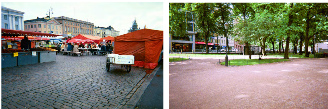
Fig.3-4 Helsinki, Market Square and Esplanade

The park, although well maintained, could be improved in several ways. The presence of benches makes it a place more for lingering than for walking through. However, some parts of the park have become a drinking haunt for some people. Furthermore, the appearance of the people frequenting it is somewhat sad, and this impression is borne out by some of the answers to the questionnaire. One of the reasons for this, climate issues aside, might be the scarcity of meeting places or places providing occasions for social contact in the park (fig.4). Furthermore in some parts of the park, especially near the entrance and at the back, stands selling flowers and food and picnic tables are set up without any semblance of order, generating a sensation of chaos. Finally, the noise from the streets flanking the park is quite loud and annoying.