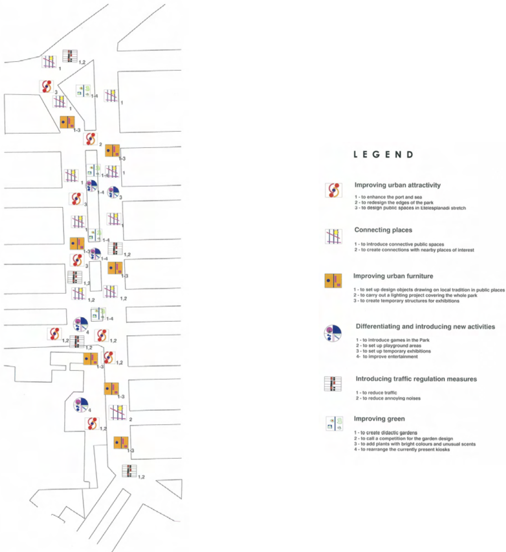
Fig.5 Helsinki, complex map of design

step is to add plants with bright colours and unusual scents , and also pleasing to the touch, or yielding edible fruit – such as strawberries – to stimulate visitors' olfactive, visual, tactile and gustative senses, and waterworks in the fountains to stimulate their auditory sense. The fourth step is to rearrange the currently present kiosks to fit with the new activities in the park.