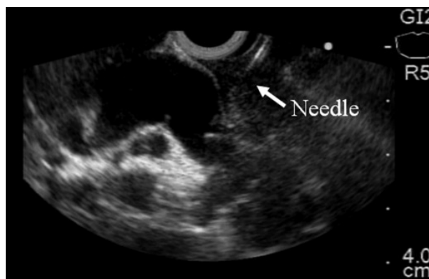
Figure 2. EUS linear image demonstrating common bile duct puncture.

A 0.035 inch guidewire was introduced through the EUS needle, using fluoroscopy. An attempt was made