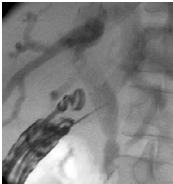
Figure 3. EUS guided cholangiography.

to pass the guidewire through the lesion to reach the duodenum as a “rendezvous” maneuver, without success.