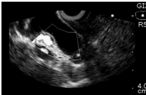
Figure 1. EUS linear image demonstrating common bile duct dilatation.

fentanyl and propofol. It was a procedure involving an obstructed biliary system, and a prophylactic antibiotic (ciprofloxacin 400 mg i.v.) was used, only in the beginning of the procedure.