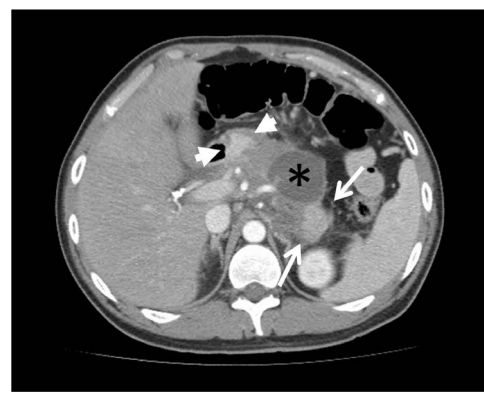
Figure 2. CT image showing walled-offnecrosis (WON) causing pancreatic-duct disruption (PDD). A young, otherwise healthy male with moderately severe acute alcoholic pancreatitis developed an acute necrotic collection (ANC) in the mid-body of the pancreas that matured into WON (asterisk) over the subsequent month. The patient had recurrent symptoms and failure to thrive due to failure of the secretions from the viable pancreatic tail (arrows) to traverse the area of pancreatic necrosis (asterisk) to reach the viable pancreatic head (solid arrowheads). Percutaneous and endoscopic efforts failed, and he underwent successful open debridement, with a Roux-en-Y cystojejunostomy. After an uncomplicated recovery, he is well nearly 2 years later.

Acute pancreatitis has a remarkably wide range of severity, from clinically negligible to precipitously fatal despite any intervention. Distinguishing APFC and PP from ANC and WON is important and relies of the use of PPCT. Initial appropriately aggressive resuscitation is essential. Progression to multiorgan failure can occur rapidly and portends a life-threatening course. Antibiotics should be withheld in most cases of noninfected necrosis, but when used, imipenem or meropenem are the agents of choice. Early enteral feeding should be encouraged. Intervention for infected pancreatic necrosis should be based on a minimally invasive approach, akin to the "step-up" approach. In all cases of necrotizing SAP, a multidisciplinary approach is needed, using endoscopic techniques, percutaneous drainage, and then, if needed, VARD. Open surgery should be reserved for failure of less