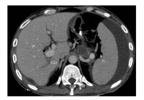
Figure 4b: CECT venous phase shows near complete resolution of transient hepatic attenuation difference with thrombosis in a tributary of portal vein (arrow).

Figure 4a: CECT arterial phase demonstrates a sectorial type of transient hepatic attenuation difference with a straight border (solid arrow). Also note thrombosis in a tributary of portal vein (arrow) with fluid collection in the body of pancreas.