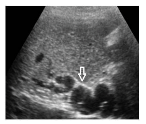
Figure 1: Sonogram shows replacement of main portal vein with multiple serpiginous, anechoic channels (arrow) that on color Doppler interrogation revealed slow flow.

Pancreatitis associated splenic complications manifest as infarction, spontaneous rupture of spleen (SSR) or subcapsular hematoma [29].