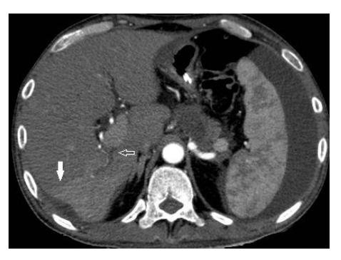
Figure 4a: CECT arterial phase demonstrates a sectorial type of transient hepatic attenuation difference with a straight border (solid arrow). Also note thrombosis in a tributary of portal vein (arrow) with fluid collection in the body of pancreas.

Due to direct fistulisation between venous lumen and a pancreatic pseudocyst