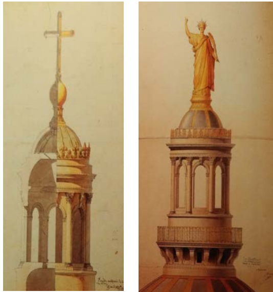
Fig. 3-4: Louis-Pierre Baltard, Projet de croix pour le couronnement de la lanterne de l'église de Sainte-Geneviève , 1822. Pierrefitte-sur-Seine, Archives nationales; on the right, Edmond Destouche, Projet pour l'installation d'une statue colossale de «L'Immortalité» par Cortot sur la lanterne du Panthéon , 1842. Pierrefitte-sur-Seine, Archives nationales.

colossal statue, namely the Renommée . Its role had to be the emblem of an almost mythical story, whose echo can be seen in an article of the Journal de la Montagne : «Un Panthéon s'élève au milieu de la commune centrale de la République: ce monument de la renaissance nationale est aperçu de toutes les frontières; qu'on l'aperçu donc aussi du milieu de the Océan» [Deming 1989, 135]. The work was conceived in lead because it was economically unsustainable in bronze and, also, it would be too heavy because of the load, when the questions regarding the instability of the piliers and consequently the crisis of the entire dome system came up again, the idea of the colossal statue was abandoned.