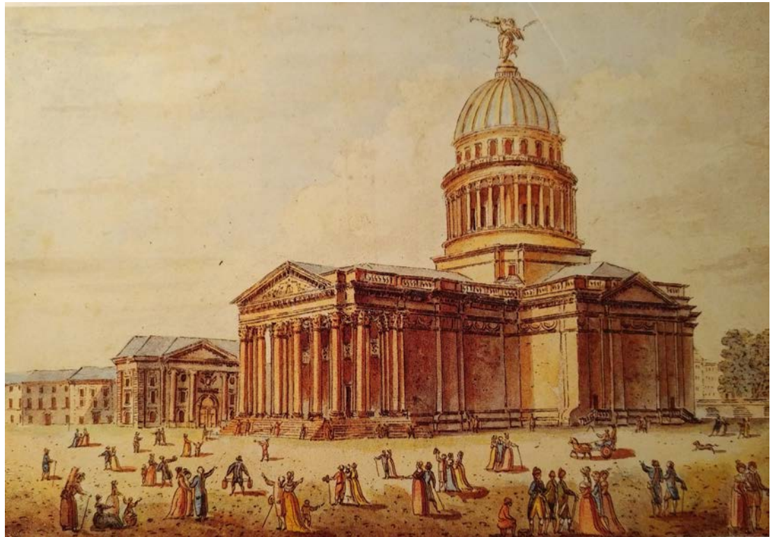
Fig. 2: Pierre-Antoine de Machy, Le Panthéon , c. 1792. Paris, Bibliothèque nationale de France, département Estampes et photographie, RESERVE FOL-VE-53 (H). General view with the statue colossale designed by Quatremère de Quincy.

derstand the relationship of the 'dome' structure and the multidimensional meanings that it develops, also providing particular interpretative and critical parameters that inevitably affect the restoration work.