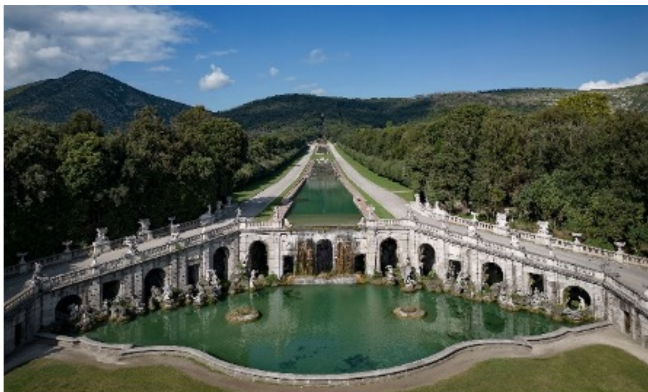
Figure 2: Royal Park: "Aeolus Fountain" and "Waterway".

been carried out relating to specific taxa such as orchids (Croce, 2021).